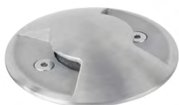
2-way Mini drive over cover