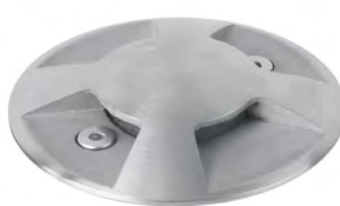
4-way Mini drive over cover